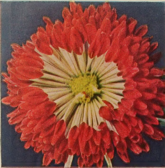
RUBY SPOON. 60c each; 3 for $1.50